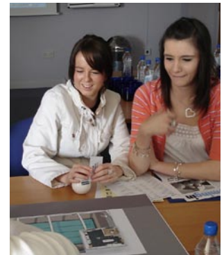
Building Blocks - thrashing out initial design ideas using cut out blocks.