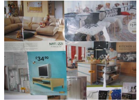
The Boys' Mood Board - somewhere to sit, somewhere to cook and a really big TV