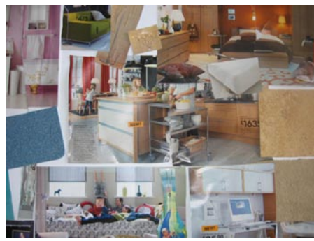
The Girls' Mood Board - somewhere to sit, somewhere to cook and a really smart PC